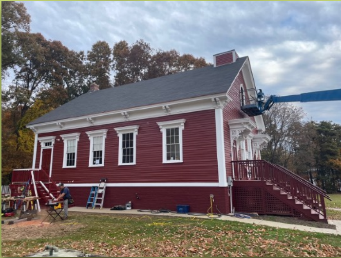
A new cupola base has been installed

We will hold Open House and Holiday Shoppe event from 10:00 am to 3:00 pm on Saturday, November 18th. Please join us as we reopen our doors!