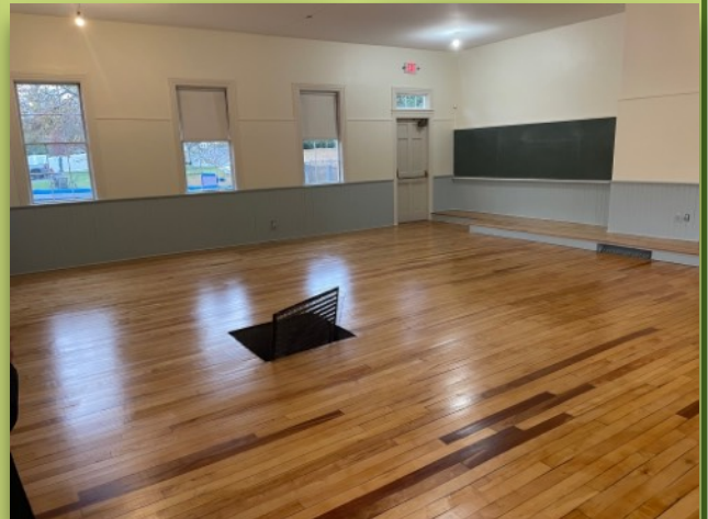
The original wood floors have been refinished