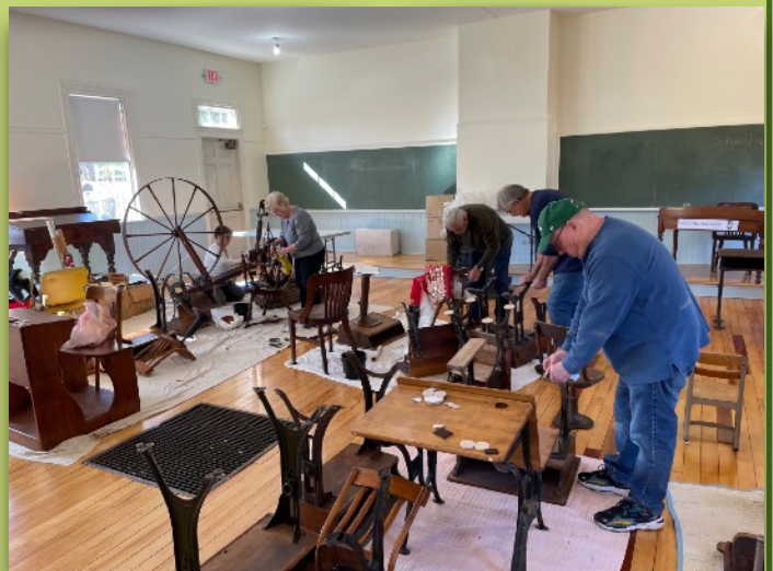
Volunteers work to replace the student desks and artifacts