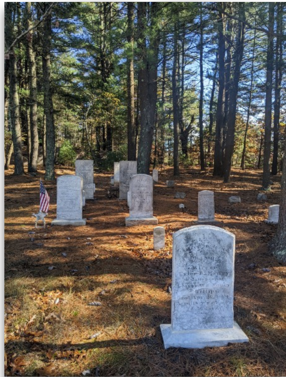
Capt. Luke Phillips Cemetery

Our cemetery restoration teams have finished their work at Hotchkiss Cemetery and NS09, the Capt. Luke Phillips Lot on Pound Hill Road for the season. Work will resume at these and other cemeteries when spring sunshine and warm temperatures return next year!