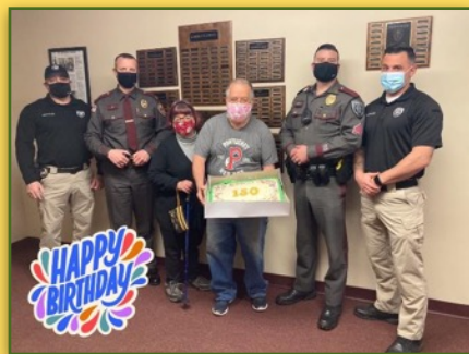
North Smithfield Police Department