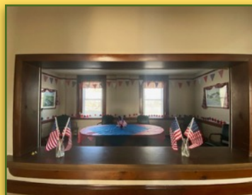
NSHA members celebrate at the newly renovated Memorial Town Building.