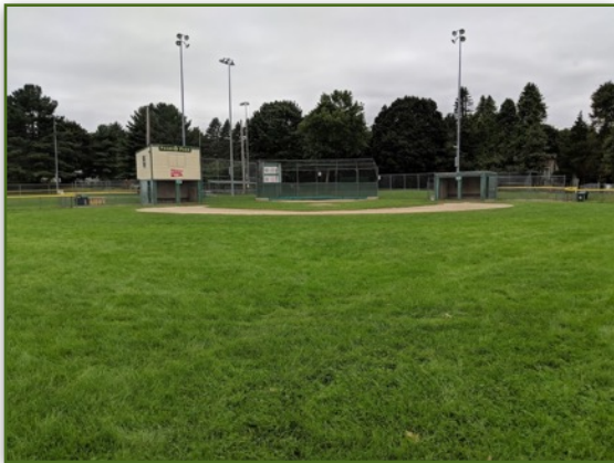
Little League field at Pacheco Park

My love of music continued to grow through Junior and Senior High School in North Smithfield. My two huge passions and interests in high school were music and baseball. The North Smithfield school system provided a nurturing and supportive environment for me to explore both of these areas of interest. The high school music program had an excellent reputation filled with past successes, a well-rounded music education program, motivational and accomplished music educators, and numerous All-state caliber musicians as students. During my years at NS, our music program was uniquely comprised of so many talented musicians many who have continued on a musical career path. The friendships that I forged during my high school years were very meaningful and deep-rooted. In