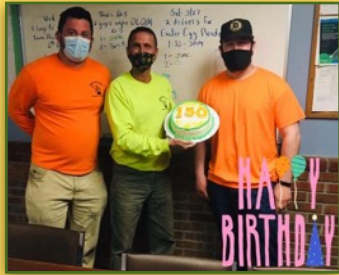
North Smithfield Department of Public Works

Several of these photographs were compiled by public stories about North Smithfield's 150th birthday celebration on March 24, 2021; the photos below of the celebration at the Memorial Town Building are courtesy of Charlie Dubois.