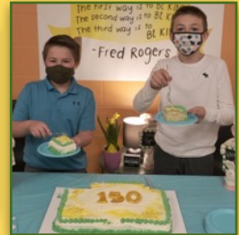
Students, staff, and teachers at North Smithfield Elementary School, Middle School, and High School celebrate the town's 150th Anniversary.